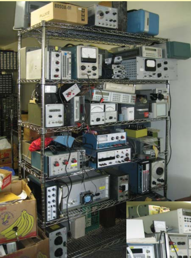
Some shots inside the main radio / electronics repair and maintenance room at N3KVV's QTH