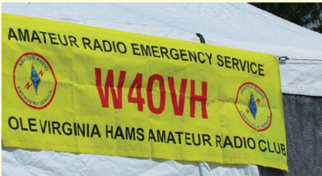
Some Pictures from 2011 OVH Field Day: