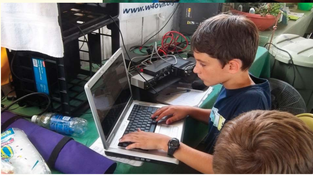
The visitor returns another day to make PSK contacts on the 20 meter HF band