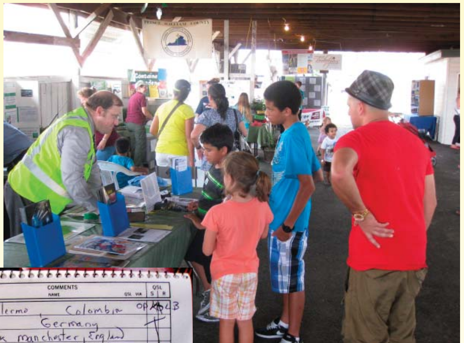
Logbook for some of the HF ham radio contacts made during the Prince William County Fair note: DX contacts!