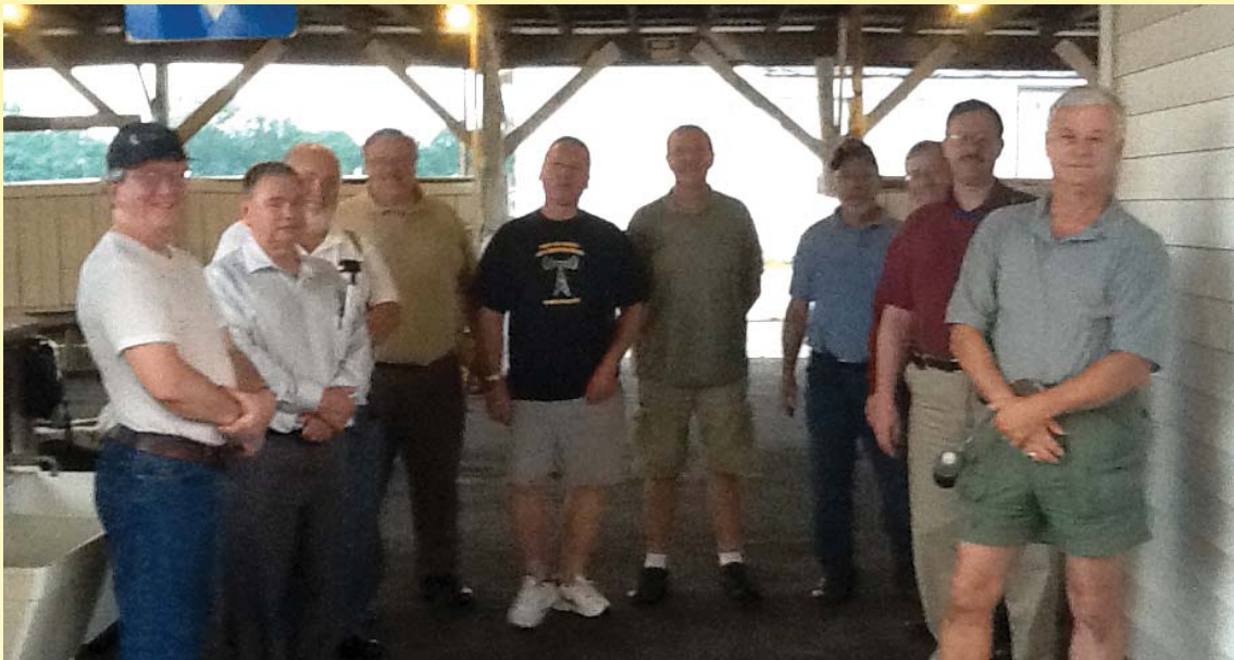
Some of the OVH attendees at the last planning meeting before the Prince William County Fair ham radio event