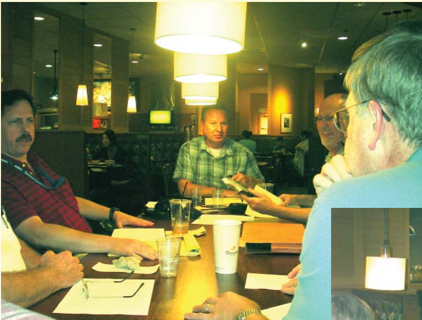
Scenes from the First Hamfest Committee Meeting held on October 3, 2012 to plan and make arrangements for the 39th Manassas Hamfest which will be held on Sunday, June 9, 2013