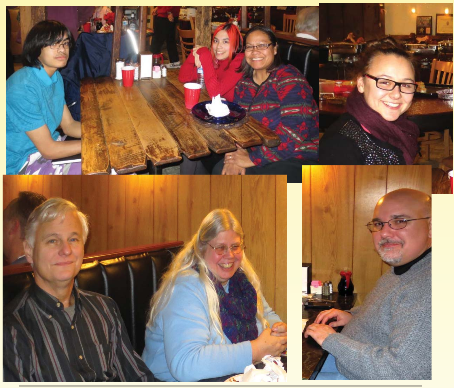
Some Possibly Interesting or Useful Information

1. A lot of OVH members, particularly some of the older ones who remember the 1950's, '60's and/or '70's when surplus radio equipment from World War II was still readily available very inexpensively, are interested in such old equipment. Some still have some of it. An interesting web site with hundreds of photos and explanations about of a wide range of such old gear is at http://aafradio.org/. Enjoy!