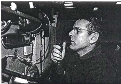
Astronaut Bill McArthur KC5ACR/NA1SS

Using just basic Ham equipment, I've previously been fortunate enough to make voice contact with Russian cosmonaut Sergey Krikalev, and American astronaut Shannon Lucid, while they were aboard the Soviet Space Station, MIR. I've also sent email messages to other Hams via the computers on board MIR while it passed overhead.