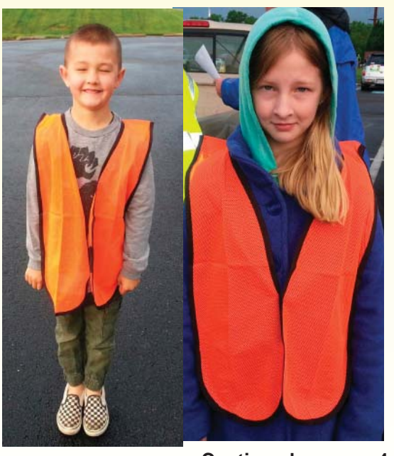
Continued on page 4 OVH ARC Newsletter - May 2016 - Page 3 of 12

The Manassas Air Show was also on May 7th, this