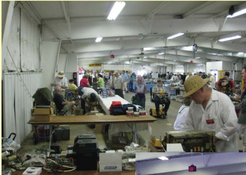
This page - indoors in the Main Commercial Building at the Prince William County Fairgrounds