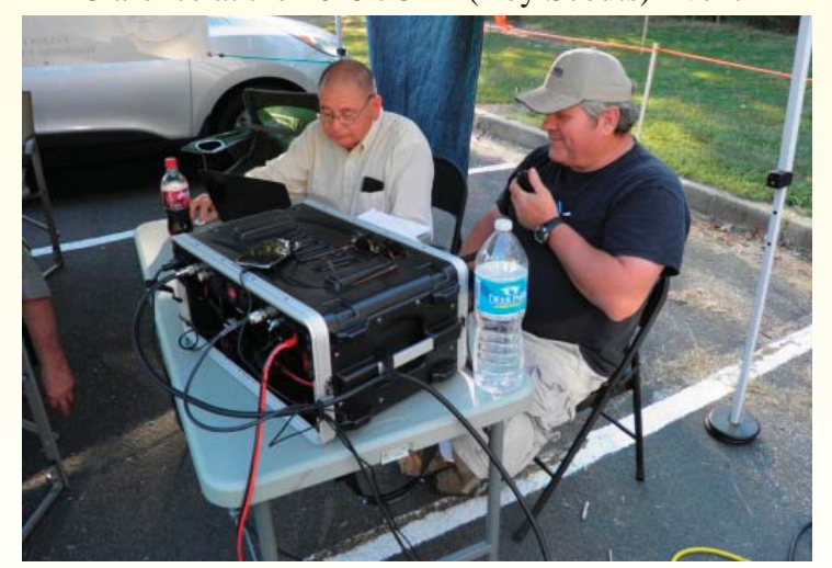
Clarence operating during the 2015 Convoy Event