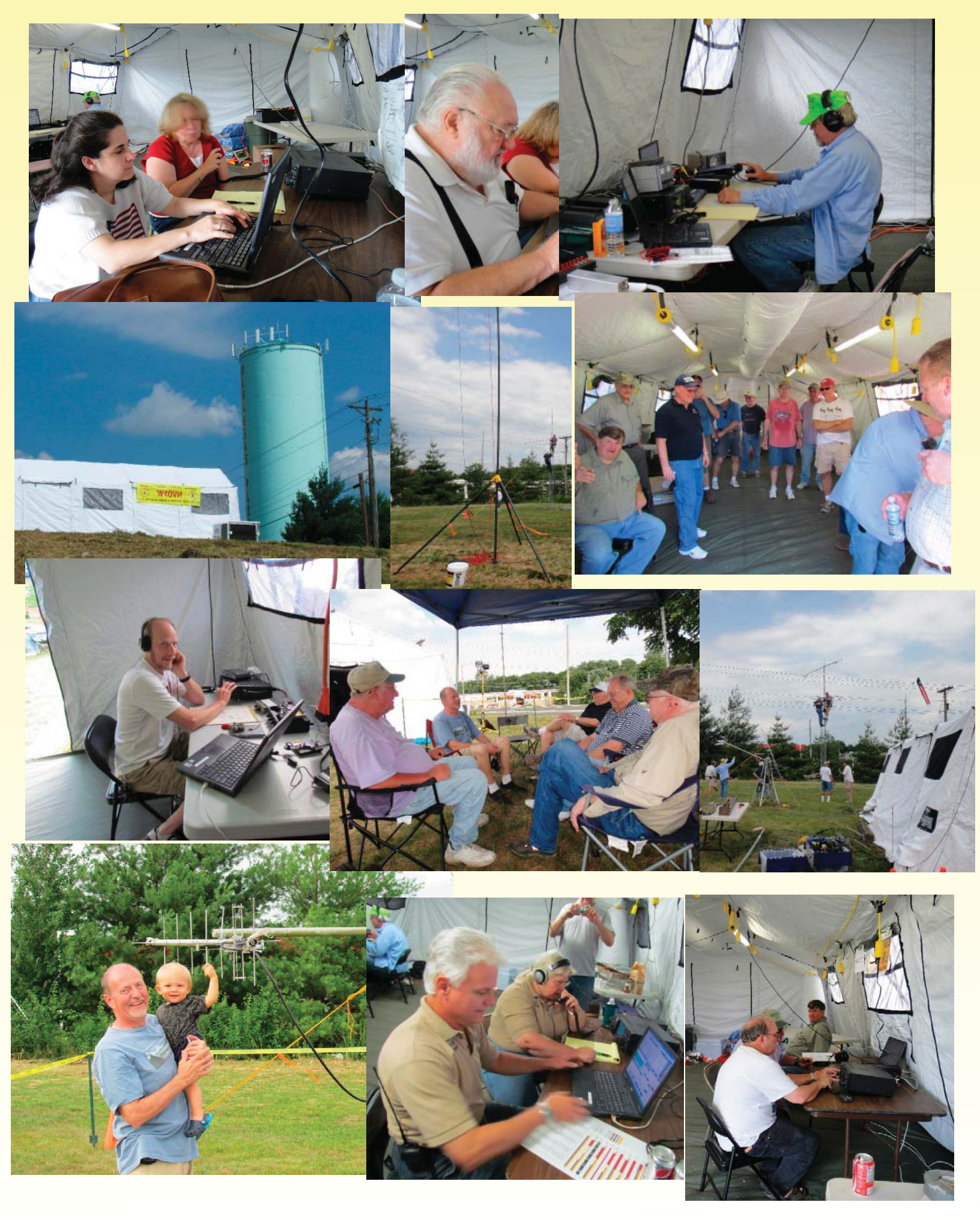
OVH ARC Newsletter - July 2011 - Pg 8 of 8