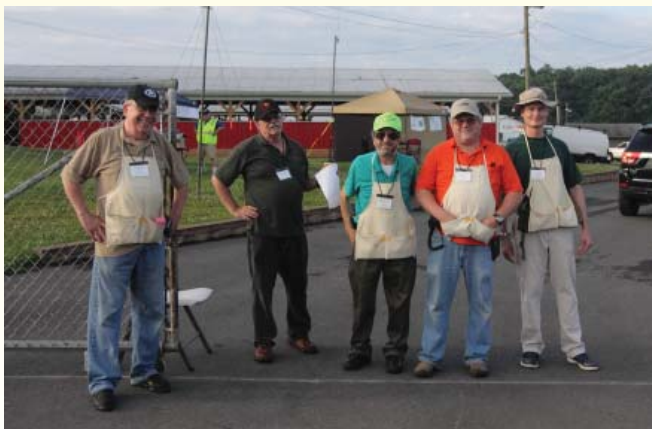
Some of OVH's Ticket Collectors / Checkers