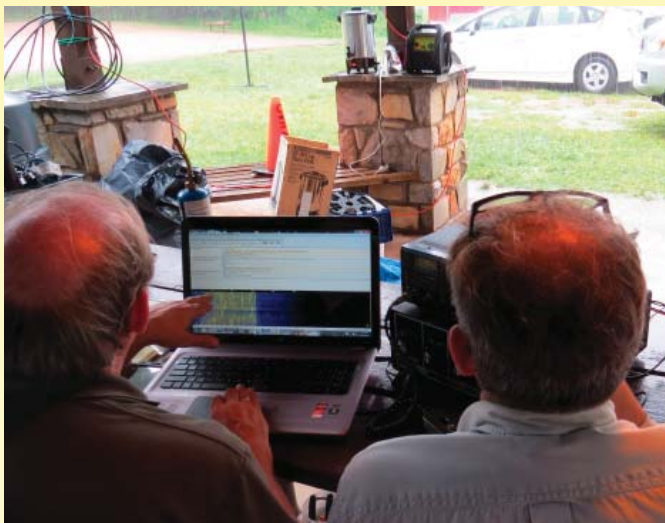
Making PSK - Digital Mode Contacts!