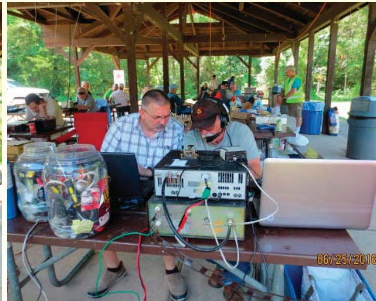
Continued on page 9