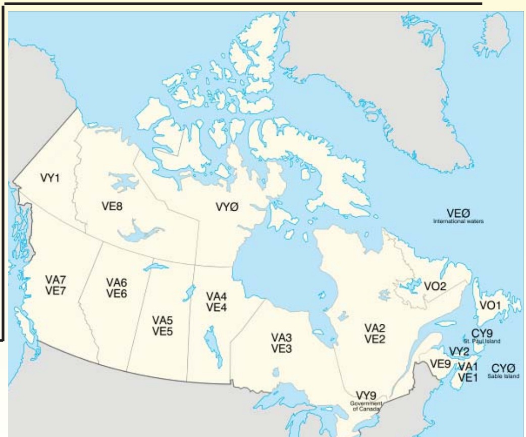
Diagram to the right: Current callsign prefixes for the Provinces and Territories of CANADA to our north

All OVH club members are urged to visit the new web site and provide feedback about it with specific, constructive comments, preferably in written form. Additional features can and likely will be added based upon utility, feasibility and long term maintenance considerations. The new web site is hosted by a reliable commercial firm and is expected to be up and available 99.999% of the time without human intervention by the webmasters or others except for content updates and web site enhancements or changes.