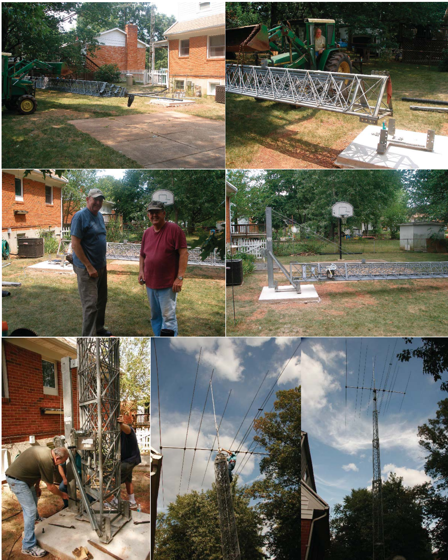
Completion of re-installation of the Tower with a new antenna system at W4HJL's QTH.