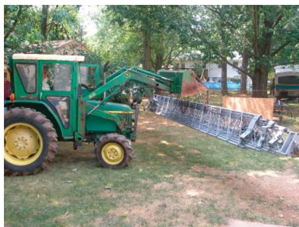
Initial handling of the tower upon arrival at W4HJL's QTH