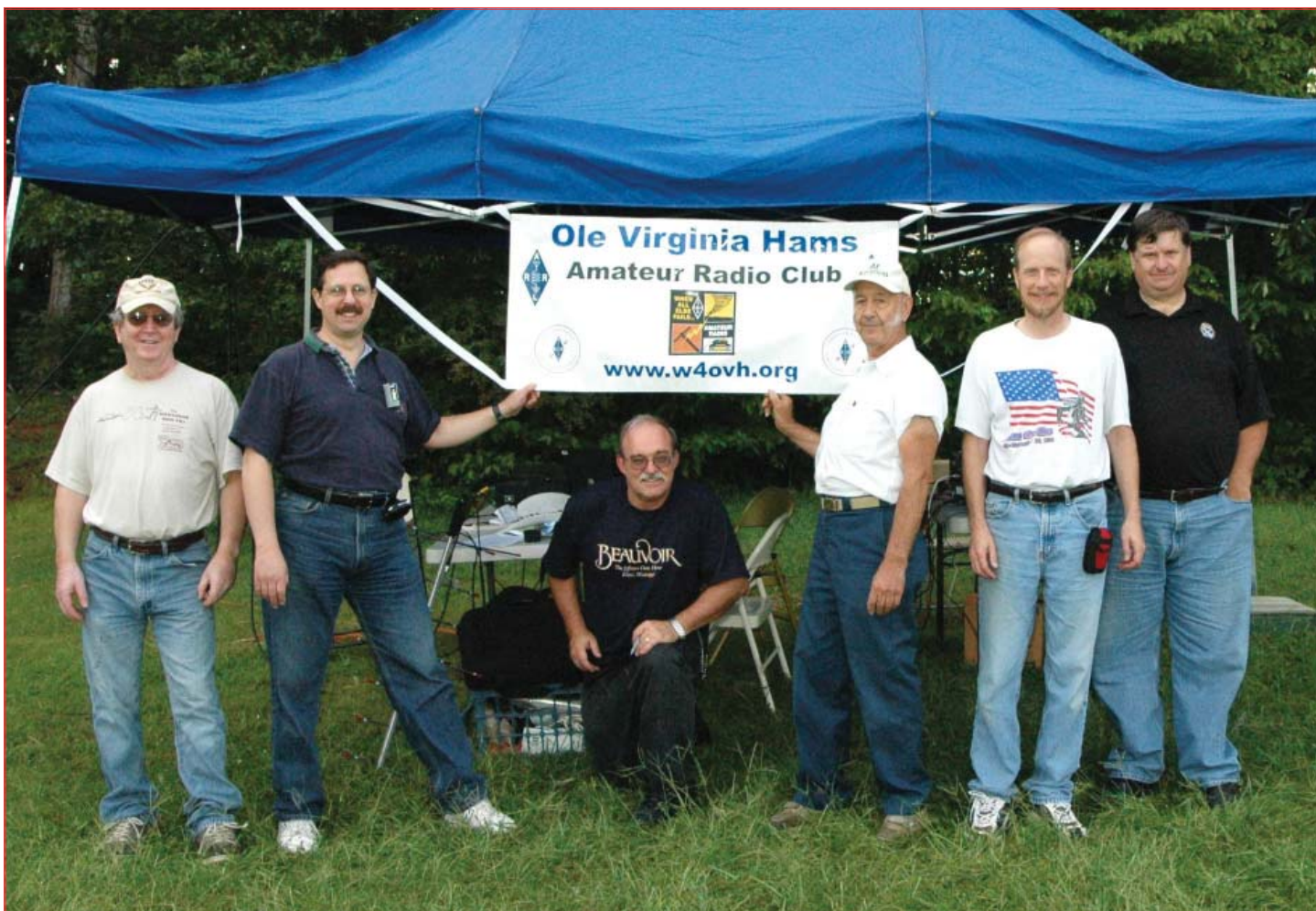
Some of the OVH crew at the Station at Signal Hill Park, Manassas Park, Virginia.