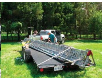
Salvaging / recovering the tower and its components at its former location for transport to W4HJL's QTH