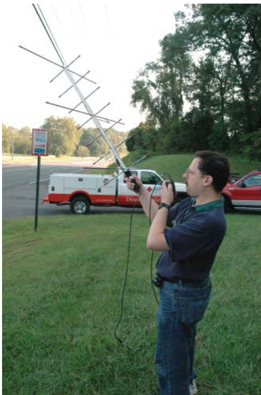
Making Contact with YV6PM in Venezuela via Satellite