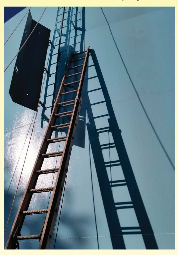
A first new OVH repeater antenna is up and secured - early Sept. 2016