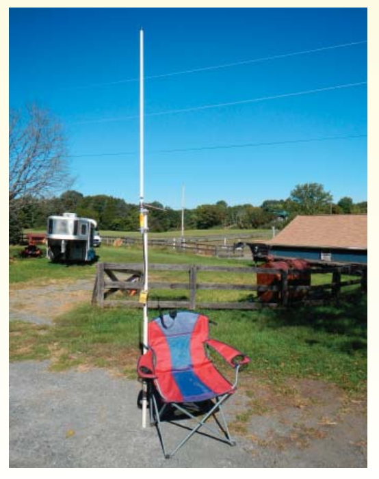
OVH ARC Newsletter - October 2017 - Page 9 of 10

for more than a few miles. It is just about perfect for use while sitting in the portable chair. I have since fashioned a clip to hold the speaker mic on the mast next to the HT. I found that the antenna was unstable with a mast more than 10 feet in length. Works great sitting in the place of an umbrella in a patio table.