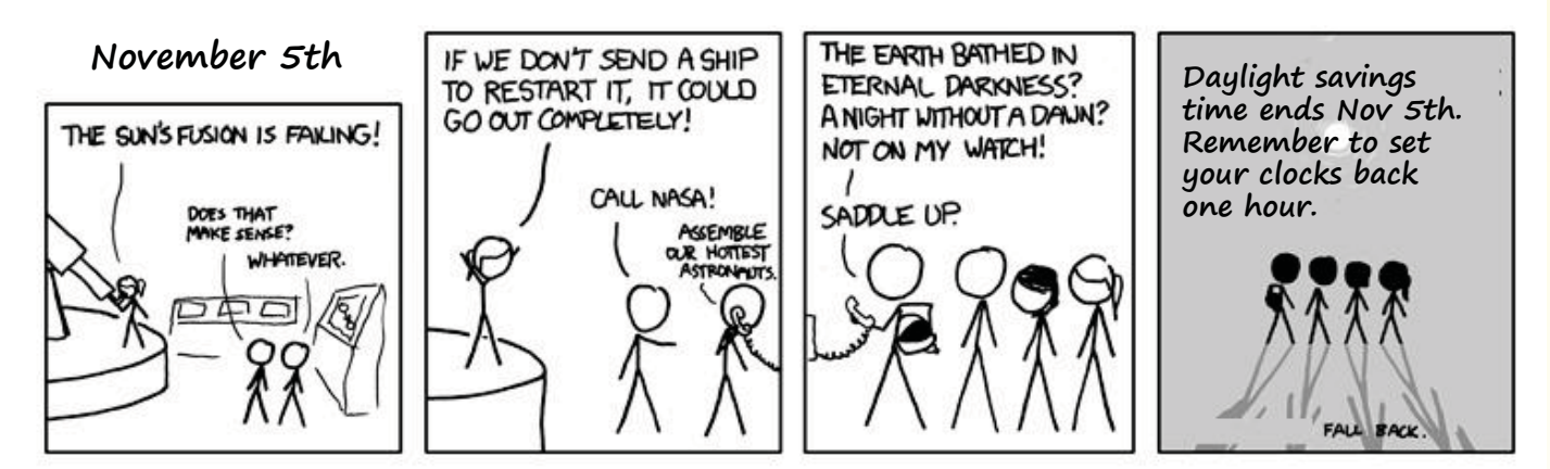
Adapted from https://xkcd.com/673/

A brief reminder from our hosts at the fire station. Please use the outside entrance directly into the Training Room rather that the main fire station entrance.