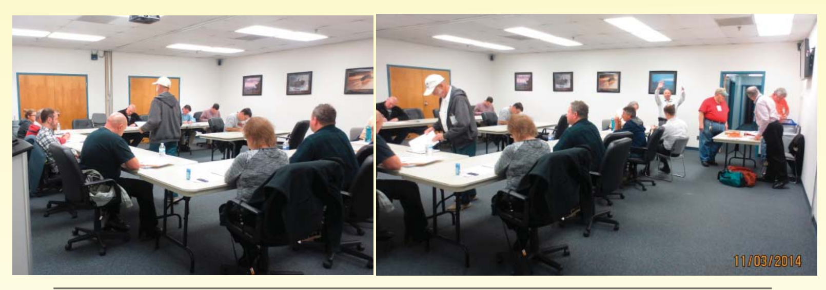
A Picture from the Hamfest Committee Meeting - November 11, 2014