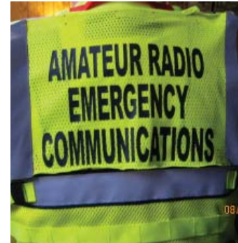
Rear panel added.