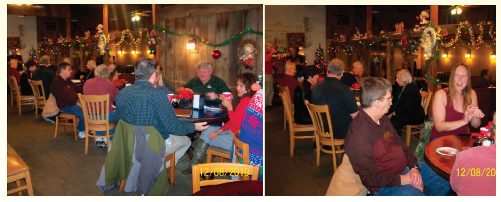
\label{eq:continuous} \begin{array}{c} \mbox{Cont'd on page 9} \\ \mbox{OVH ARC Newsletter - December 2019 - } Page 8 \mbox{ of } 10 \end{array}