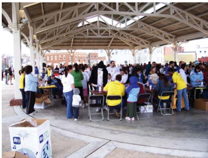
The starting pavilion before the MS walk started.