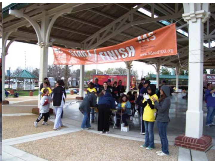
The Finish Line at the Loy E. Harris Pavilion.