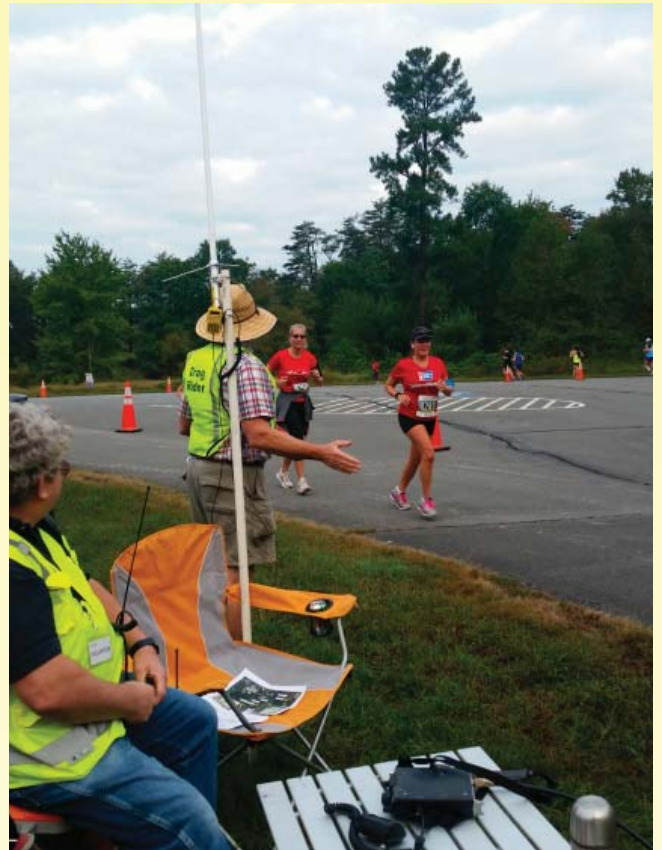
Above: Runners at Deep Cut Turn-Around On the Left: OVH Net Control