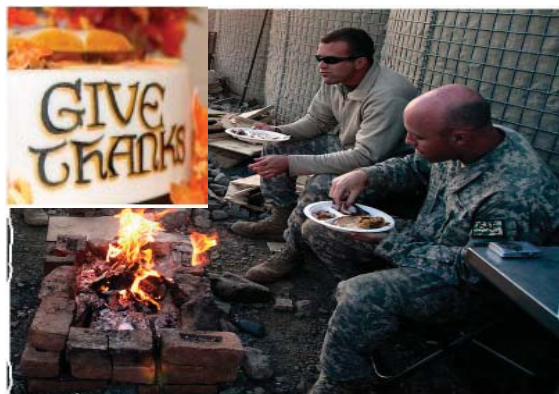
Thanksgiving on Combat Outpost Cherkatah, Khowst province, Afghanistan

The German policy of assigning POWs to work details did make the challenge a little easier. Radio parts just seemed to disappear from the repair shop now and then.