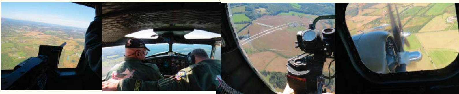
Above, L to R: View from a machine gunner's port on the left side, view of the pilots flying the B-17 from just behind them in the cockpit, view from the bombardier's window at his station, view of the two left engines and propellers turning.