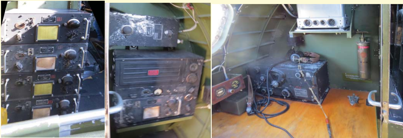
Above - (to the left) - full set of HF band tuners for the transmitter& antenna system, (center) the HF transmitter with a tuner installed, (to the right) the radio op's table with BC-348 receiver, J38 key and control boxes. Below, other pictures.

Some of the WWII HF radios are shown below, as are other images taken during the flight,