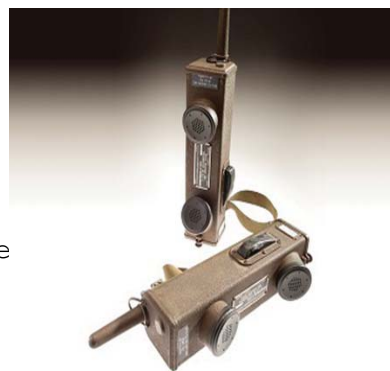
SCR-536 / BC-611 handy talkie