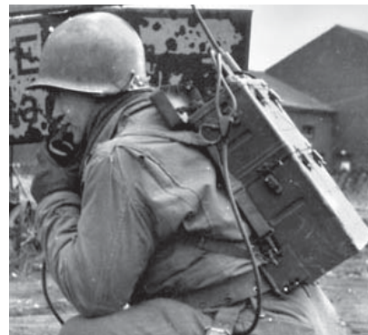
SCR-300 / BC-1000 walkie talkie