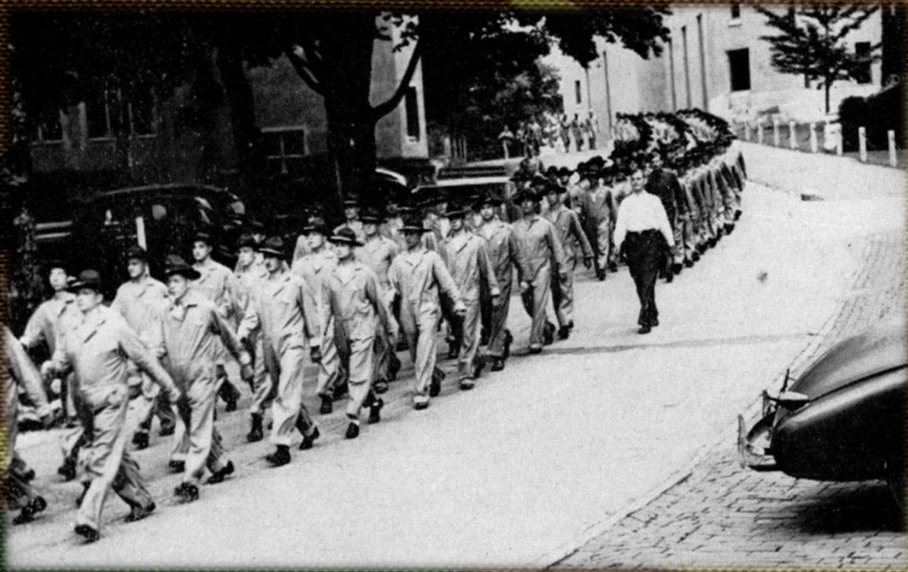
Virginia Protective Force training at VMI 1942

During WWII, Virginia Governor James Price established the Virginia Protective Force to fill the void when the Virginia National Guard was deployed for war fighting overseas.