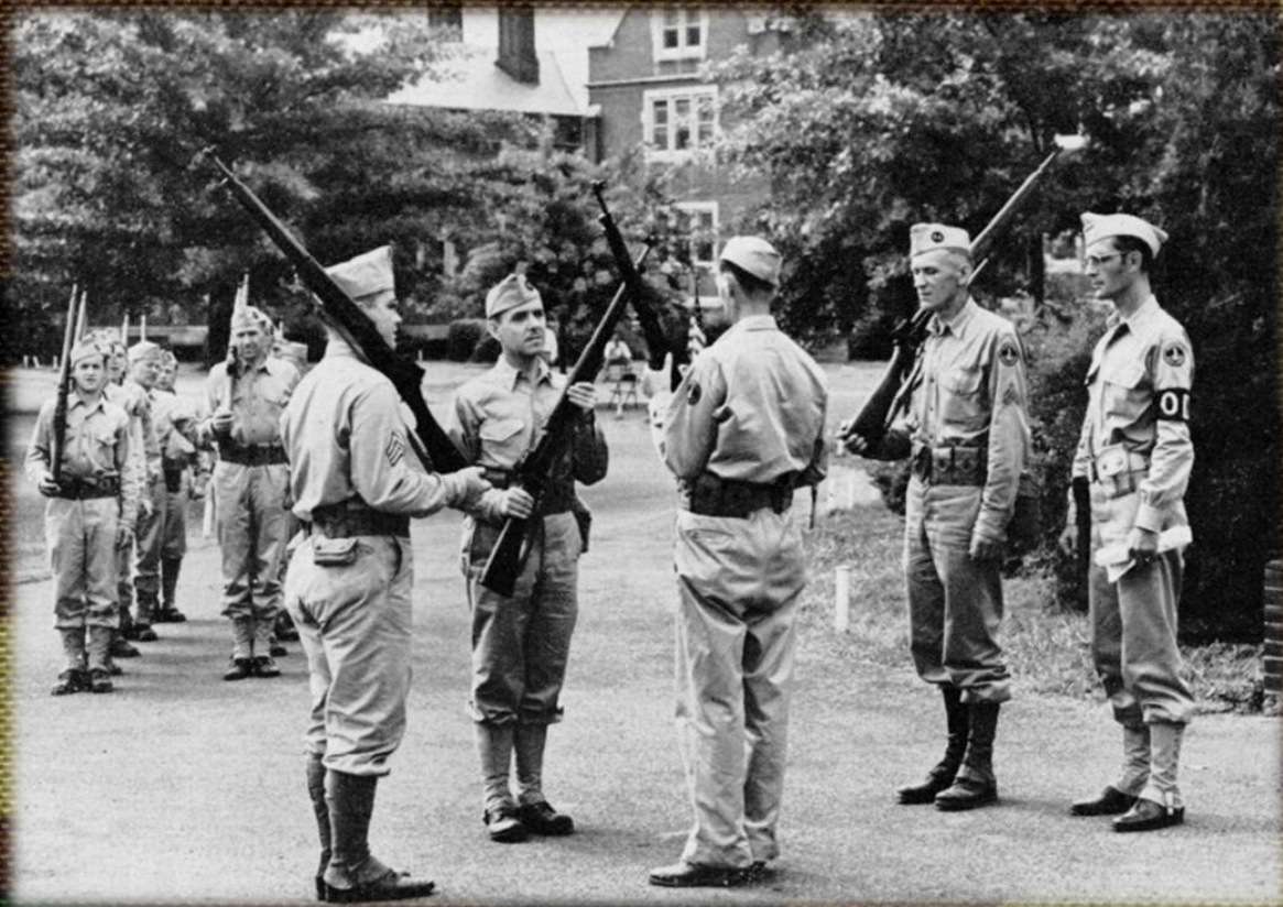
Virginia State Guard training at Roanoke College August 1944

With the same duties of guarding infrastructure, the Virginia Protective Force name was changed to the Virginia State Guard in 1944.