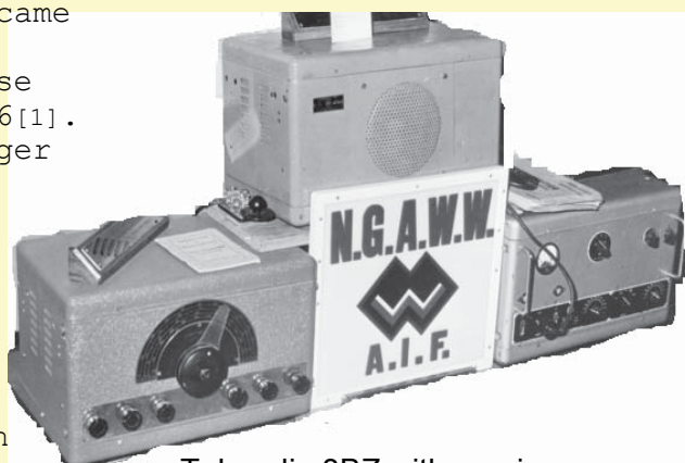
Teleradio 3BZ with receiver, transmitter, and power supply.

With no military radios available, Coastwatchers relied on commercial equipment made by Australian company Amalgamated Wireless Australasia, or AWA [2]. Their sets from the company's Teleradio 3 series were originally designed as base stations for remote Australian settlements. The 3BZ model featured a tunable receiver covering 200KHz - 30MHz and a 13 watt AM/CW crystal controlled transmitter. These, along with an antenna tuner and speaker/power supply were housed in sturdy steel cabinets. Portable power came from lead acid batteries and a generator to recharge them.