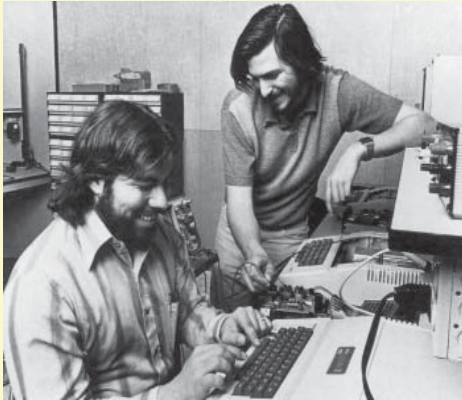
Apple Computer co founders Steve Wozniak (L) and Steve Jobs.