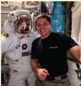
Bob Behnken, KE5GGX, recently returned from the first manned space flight of the SpaceX Dragon Crew Capsule.

https://www.dx-world.net/keynote-speech-joe-taylor-k1jt-wsjt-x-ft8-and-beyond/