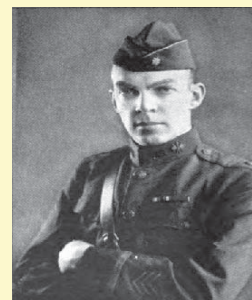
Armstrong in his Signal Corps uniform.

Armstrong grew up in suburban New York at the turn of the century and was fascinated by wireless technology. By age 14 he had filled his bedroom with wireless gear and erected a 125 foot antenna on his parents property (no HOAs in those days). He was soon accepted at Columbia University where he received his electrical engineering degree in 1913. After serving as a Signal Corps officer in WWI, he went on to an illustrious career during which he invented the superhet receiver and FM.