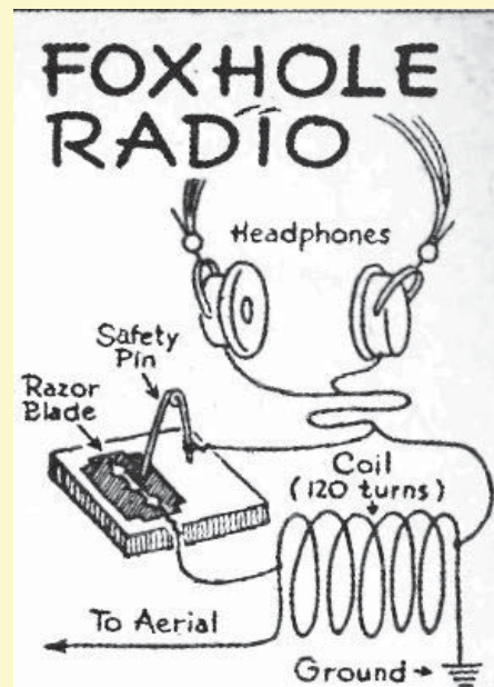
Foxhole Radio circuit. [1]