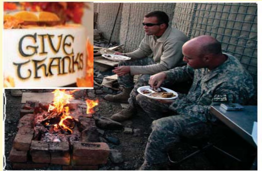
Thanksgiving on Combat Outpost Cherkatah, Khowst province, Afghanistan

The approaching holiday season and year's end are traditionally a time for reflection and giving thanks for our many blessings. This Veteran's Day, lets take a moment to express thanks to our veterans - the young ones who are in harm's way today defending our freedoms, and those who have gone before, sometimes giving all.