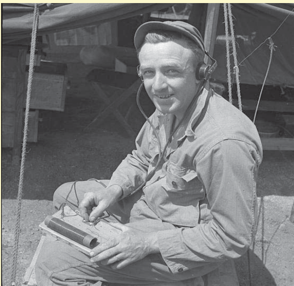
Soldier with a Foxhole Radio at Anzio in 1944.

Concerned that local oscillator radiation might give away a unit's position, WWII regulations forbade front line soldiers from building vacuum tube radios. But GI innovation soon prevailed. Credit for the original Foxhole Radio goes to Private Eldon Phelps who reportedly assembled his prototype on the beach head at Anzio in 1944. Its circuit is that of the simple crystal radios many of us built as youngsters. The clever part is the use of a rusty razor blade and safety pin contact to perform the same AM detector function as a crystal diode. Add an inductor made from scrap wire, an antenna, and a high impedance headset and the radio is complete.