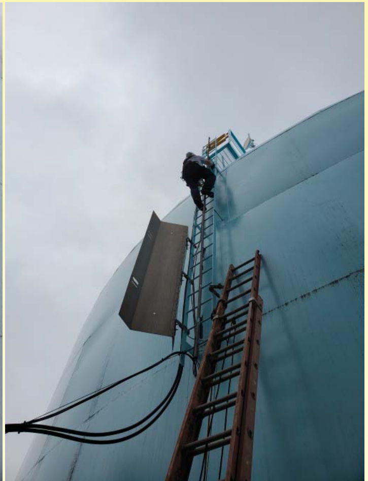
Above: Climbing requires skill, know-how and daring. Below Left: Supervisors supervising.