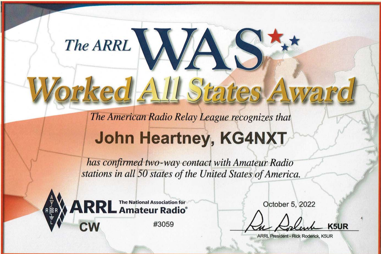
Below: The WAS - CW Award 10/5/2022 for John / KG4NXT