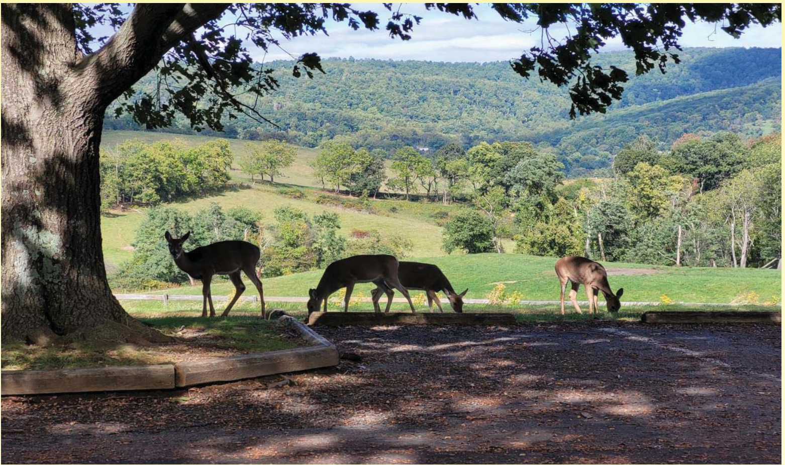
Above image from Sky Meadows Park, Blue Ridge Mountains, 10/5/2022