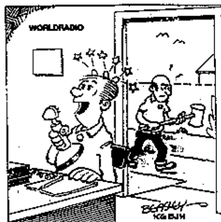
MY NEIGHBOR ALWAYS LETS ME KNOW IF I'M BOTHERING HIS TELEVISION