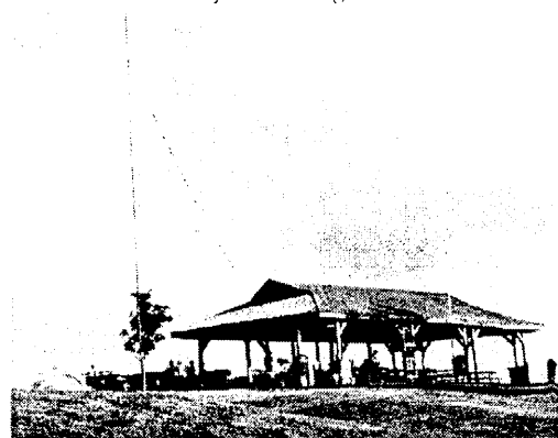
OVH Field Day at Long Park