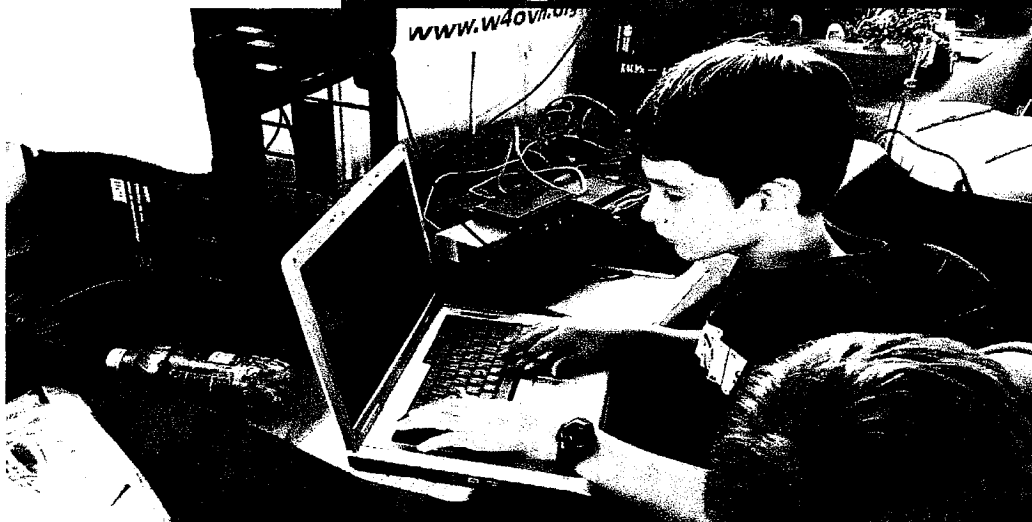
The visitor returns another day to make PSK contacts on the 20 meter HF band