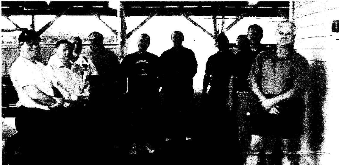
Some of the OVH attendees at the last planning meeting before the Prince William County Fair ham radio event