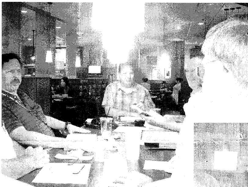
Scenes from the First Hamfest Committee Meeting held on October 3, 2012 to plan and make arrangements for the 39th Manassas Hamfest which will be held on Sunday, June 9, 2013