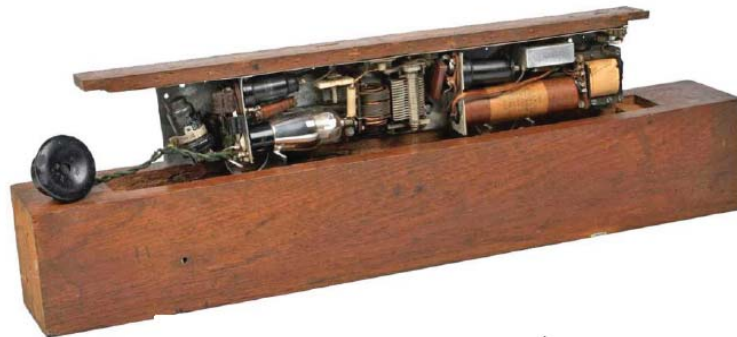
Shangi Gaol (Singapore) PoW camp radio concealed in a teak beam