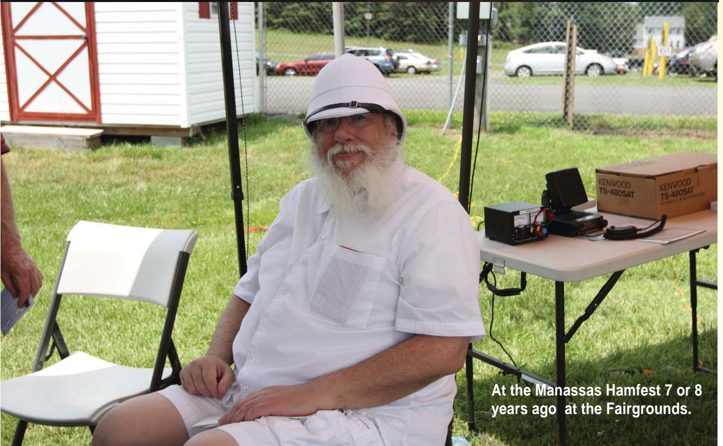
At the Manassas Hamfest 7 or 8 years ago at the Fairgrounds.